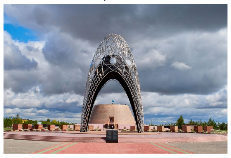
Figure 3 – Alzhir - Museum and Memorial Complex of Victims of Political Repressions and Totalitarianism