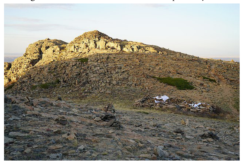
Figure 1 – The natural and historical complex "Ulytau"

This includes Kazakh khans' and great political figures' burial places (tombs), and memorable places of Kazakh history (fields of bloody battles, places of strategic decision-making, etc.). Such "places of memory" are featured, by the preservation, as the cultural and material objects during the period of Russian colonization and Soviet power. As a rule, the spiritual memory about them was deformed. The natural and historical complex "Ulytau" (Figure 1), forgotten in the Soviet period, has acquired historical relevance from the date of independence. "Ulytau" is translated, from the Kazakh language, as the "Great Mountain". But since these mountains are actually not very high, this name has a sacred meaning, because these are the "main revered mountains" where the nomads' sanctuaries have been hidden since the ancient times (Abdigaliuly, 2017, p. 89).