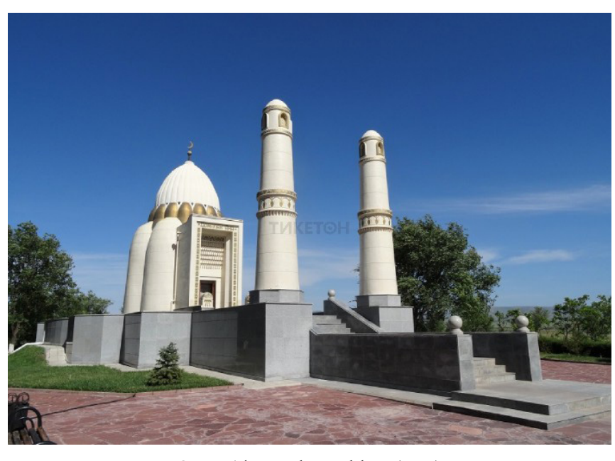
Figure 4 – The burial Domalakana

(bata) given by the older generation to the young people: "Enjoy the joy of communication with great-grandchildren". The preservation of the mental space of family relations is a special narrative of Kazakh culture. These narratives are symbols of the Kazakh people unity (Qazaqstan Tarihy, 2021). A great number of "places of memory" contain the words - markers of the traditional Kazakh values in their names: "Ata" - father, ancestor, "Ana", "Apa" - mother, grandmother, "Kyz" - daughter, girl, etc. Once these places, possibly, were associated with specific personalities, however, names are gradually supplanted from the popular memory, but the symbolic meaning and functional binding remain. Therefore, such places of memory are equally revered by all Kazakhs. Such "places of memory", for most pilgrims, are the Kazakh people's evidence of mental unity in the space-time continuum. The burial Domalakana (Figure 4) (burial of Baidibek biy's wife, 14th century) enjoys the special reverence in the Southern Kazakhstan. People respectfully called her the "Mother of the clan" for deep knowledge of traditions, Koran and skillful mastery of Oral Word. The original appearance of this structure had not been preserved. There is an inscription on the wall at the entrance: "Monument in honor of the Great Mother Bibijar, daughter of Aksultan". Further, there is a call to honor mothers. Women from all over Kazakhstan, who wish to have children, health and family well-being, visit her tomb.