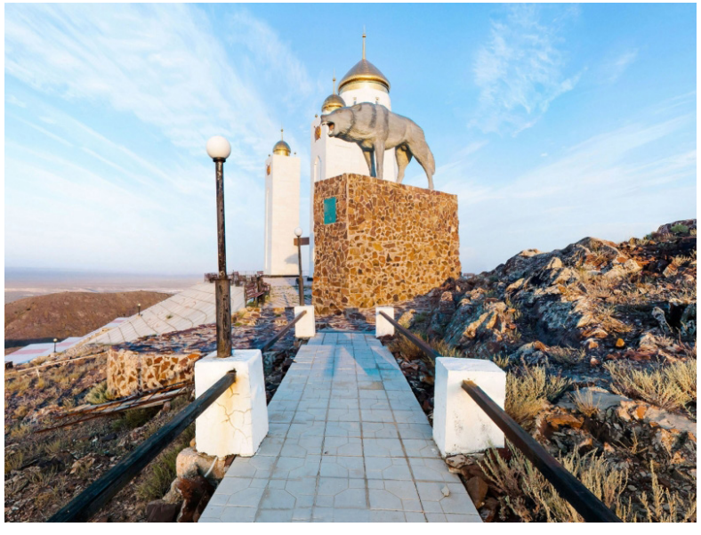
Figure 2 – Otpan Tau Historical and Cultural Complex