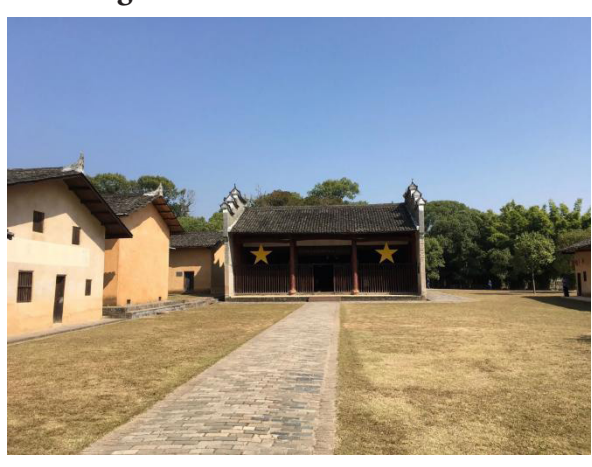
Figure 2 – Red tourist attractions

education, red genes can be truly integrated into students' ideological and political education work. To ensure the inheritance of the red gene from generation to generation, it is necessary to regard red education, as the main way to inherit the red gene, and red tourism, as an essential way to inherit the red gene. Attention should be paid to the design and innovation of systems, and a mechanism for inheriting the red gene should be established. Figure 2 shows the red tourist attractions.