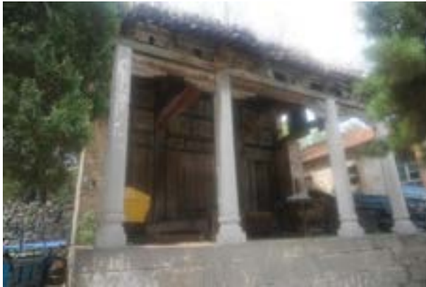
Figure 3 -Ancient theater of official house in East Ma'an Village, Heshun Town

Photographed by the author Hengli Peng, on July 22, 2019)