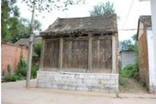
Figure 2 - Ancient Theater of Official House in Yanghe Village, Wulong Town