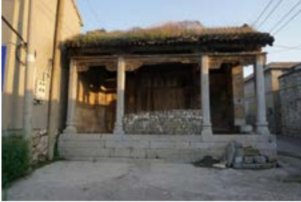
Figure 1 - Ancient Theater of Official House in Jiaoling Village, Tongye Town

Photographed by the author Hengli Peng, on August 15, 2019.