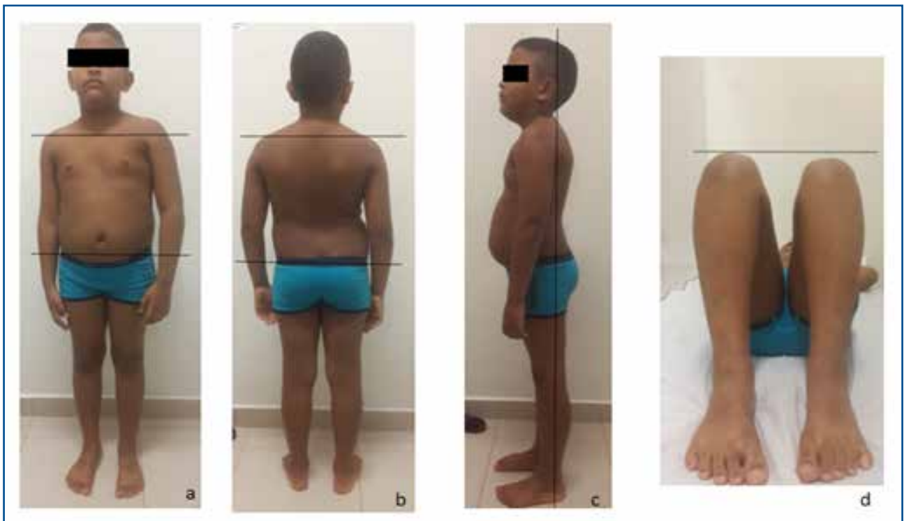
Figure A. 3: anterior view (a), posterior (b) and lateral (c), discrepancy in MMII (d).

Prognostic: With appropriate treatment, joint prognosis is often good in patients whose disease is limited to a few joints. With the introduction of the biological agent we sought remission or low disease activity and prevention of irreversible joint damage.