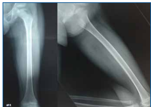
Figure A. 1: Left hip x-ray - AP / OBLIQUA.