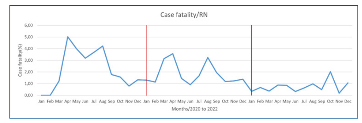
Figure 3: Trend analysis of the case fatality proportions of COVID-19 in the state of Rio Grande do Norte, Brazil, from January 2020 to December 2022

In the years 2021 and 2022, the state of Rio Grande do Norte presented a decreasing trend in the incidence of COVID-19, contrary to the pattern observed in 2020, which was marked by an increase. It is important to point out that both in 2020 and in 2022, there was an increasing trend in the incidence of COVID -19 between the months of October and December (figure 1), showing a similarity between these two periods.