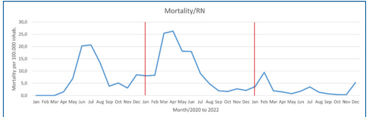
Figure 2: Trend analysis of COVID-19 Mortality rates in the state of Rio Grande do Norte, Brazil, from January 2020 to December 2022