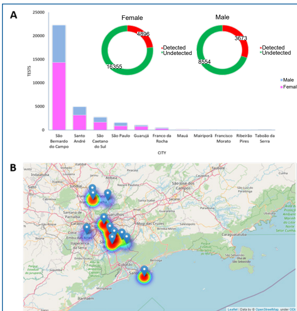
Figure 3: Representative image of the number of tests performed in the metropolitan region of São Paulo in the studied period (3/7/2020-5/31/2020) and the prevalence by sex in this period (A). Geolocation map of cities tested by the Clinical Analysis Laboratory of Centro Universitário FMABC (B). Blue circles identify the serviced cities and the difference in the size of the colored circles differentiates the volume of tests by municipality. Power BI® software